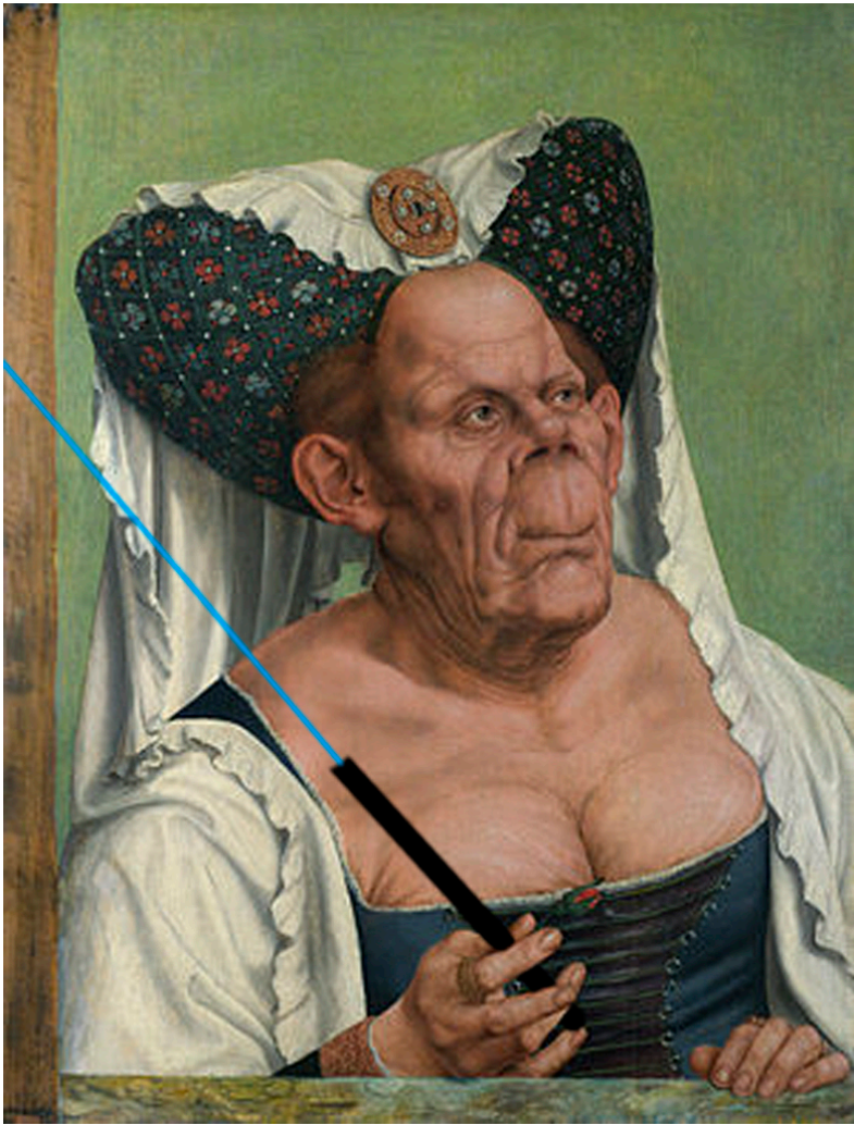
Figure 3 The Duchess of Albacore

To the left is Figure 5, The Duchess of Albacore , a portrait by Quenton Tarrynot painted C. 1513. The Duchess was known for pointing out the imperfections of others while ignoring her own. She would do this with her rare 478nm pointer, shown here at the ready.