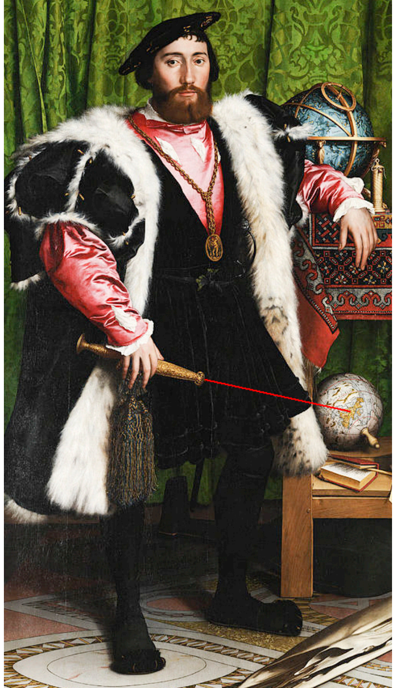
Figure 4 The Ambassador

Figure 4 is by Hans Holbein the Younger. Painted in 1533, it is called The Ambassador and shows a man wielding a highly ornate laser pointer of the type favored by the nobility at the time. He is either pointing out a feature on a globe or getting ready to pop a decorated balloon; scholars differ on this.