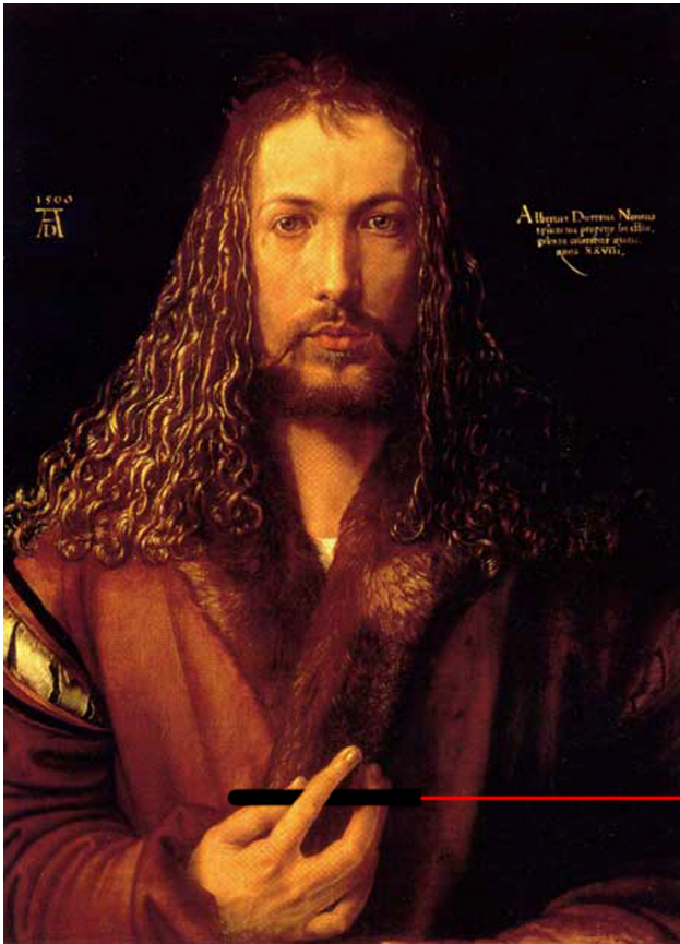
Figure 3 Man with Cat Toy

Duress really had a thing for lasers, and depicted them in several of his paintings. To the left, Figure 3, is his masterpiece, Man with Cat Toy , which featured one of the newly-re-invented feline amusement devices. Painted in 1500, it was dedicated to his cat Chasé leDot, a French chat du lap he picked up on a trip to Paris.