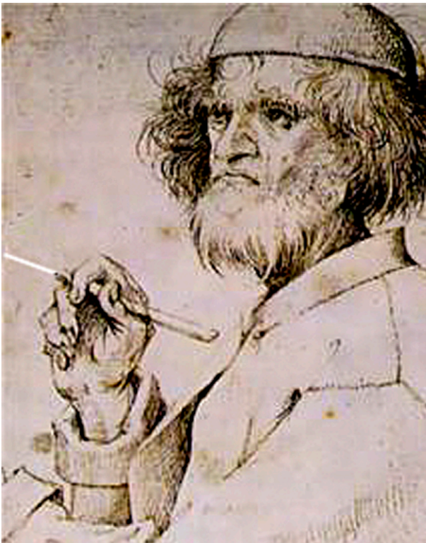
Figure 1 Man with a Pointer

Figure 1 is Leonardo Da Voltage's famous Man with a Pointer . This is a faded ink drawing with the laser beam depicted in silver oxide.